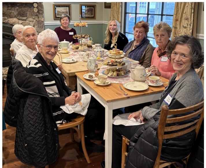
Solos enjoyed a delicious Afternoon Tea at Gruel Britannia's new Westport restaurant on November 12.

Once again we will support the Westport Department of Human Services' Annual Holiday Giving Program. We ask that you bring two or more unwrapped new books for children in kindergarten through 8 th grade. They will be distributed to local families who have registered for assistance this season. Your generosity will help ensure that every child in our community has something special to unwrap this holiday season.