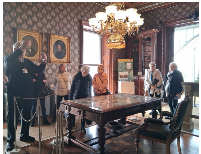
Carpool & Go toured the newly renovated Lockwood-Matthews Mansion Museum in January.